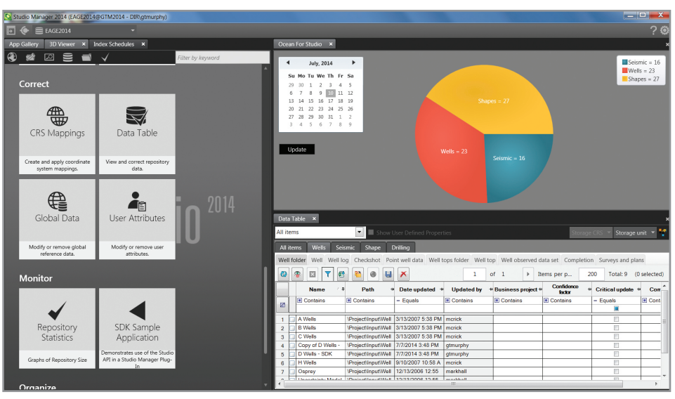
Ocean for Studio plug-in

As the Studio environment becomes the hub of your E&P knowledge network, Ocean for Studio helps accelerate your ability to find, manage, and share the information the Studio environment has pooled together. Ocean for Studio frees you to adapt to new challenges and solve them by taking advantage of the Ocean framework ecosystem and the power to dynamically extend the Studio knowledge environment.